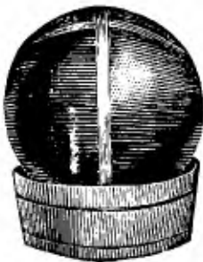
Solid Shot strapped on a Sabot.

There is a Confederate flag waving from it defiantly. A proud day it will be when we haul it down and raise in its stead the stars and stripes, never to be displaced again. The buildings in the city must, by this time, be pretty well riddled with shot and shell. The women, it seems, did not all leave the city before the bombardment began, and I suppose they have determined to brave it out. Their sacrifices and privations are worthy of a better cause, and were they but on our side how we would worship them.