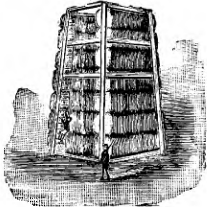
The Yankee Lookout.

A report creeps into camp that Johnston is coming with fifty thousand men to raise the siege, but I do not believe it. We have often heard that Richmond had fallen, but it continues within the confederate lines. If the army of the Potomac does not soon take it, Grant will march us there and seize the prize from them.