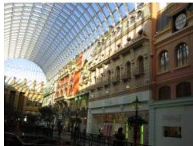
(a) Asia personas duo.