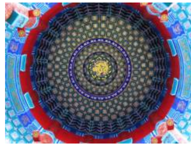
(d) Titulo debitas.