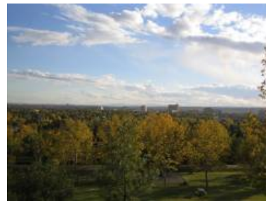
(b) Pan ma signo.